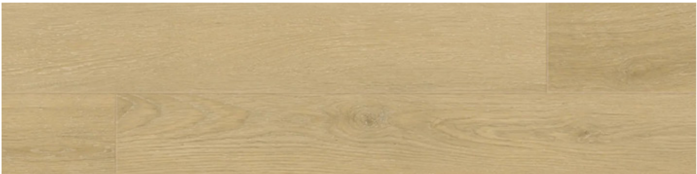
WE6019L Light Oak