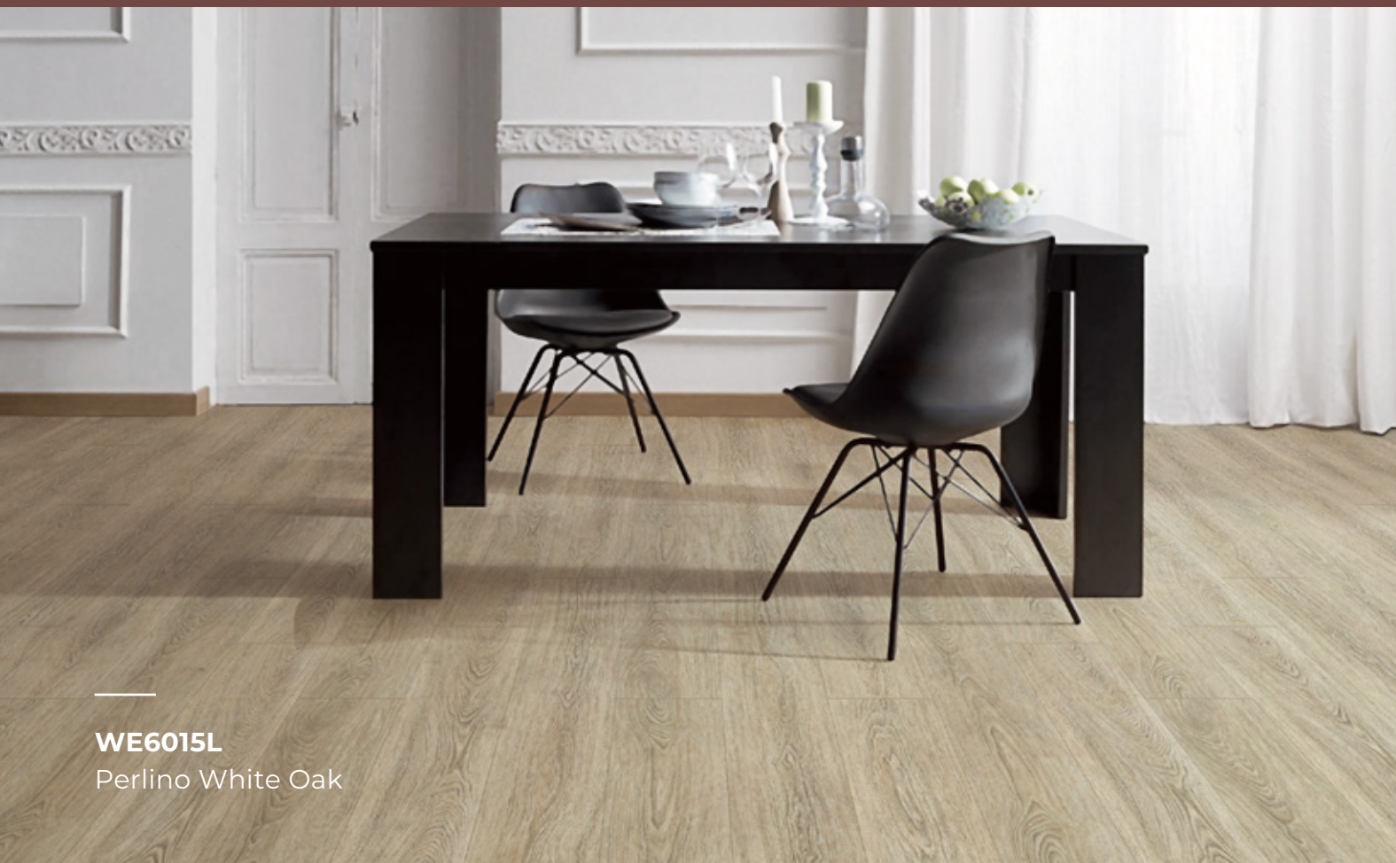
WE6015L Perlino White Oak