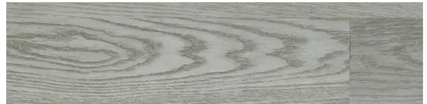
WE6010S European Cotton Oak

Shade and veining of actual product may vary from digital / printed image.