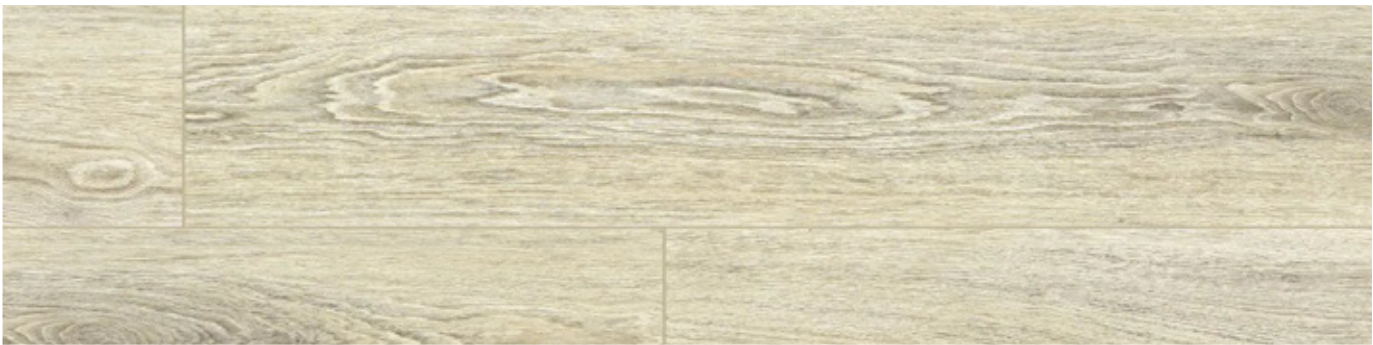
WE6014L Urban Ash Grey