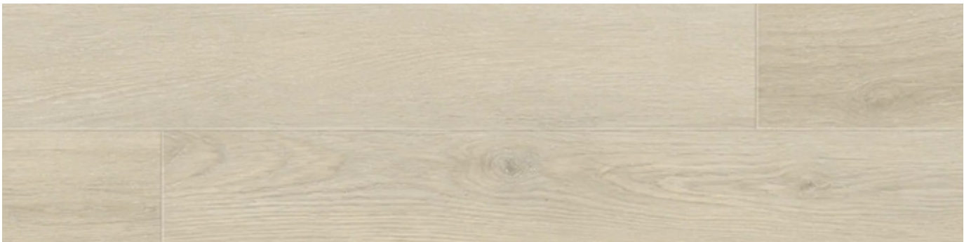
WE6018L Cotton Oak