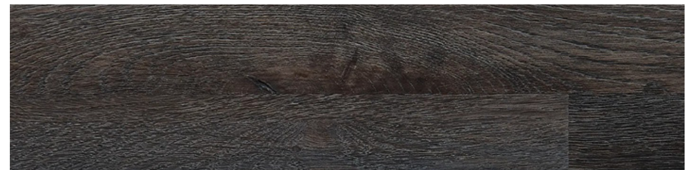
WE6016S Burnt Walnut