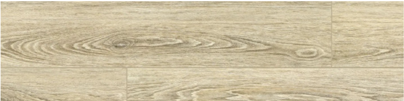
WE6015L Perlino White Oak