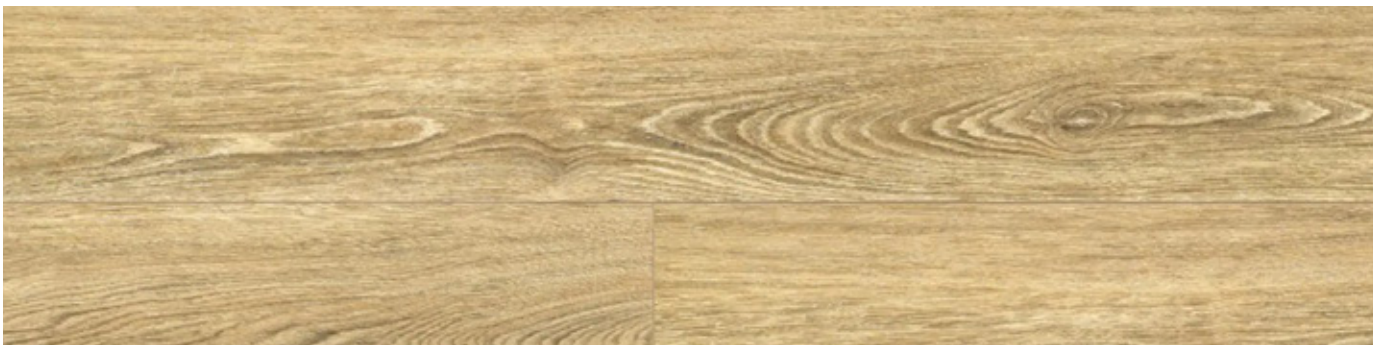
WE6013L Modern Autumn Oak