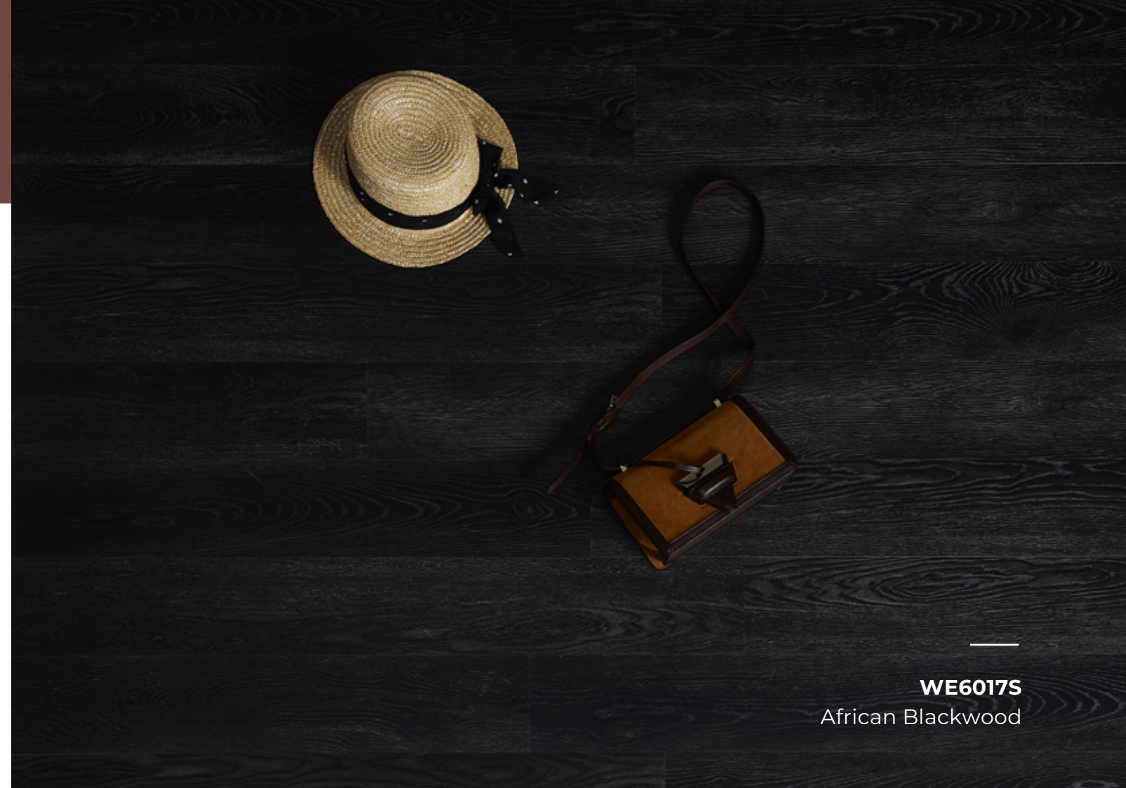
WE6017S African Blackwood

Wood Culture is a subsidiary of Hafary Holdings Limited.