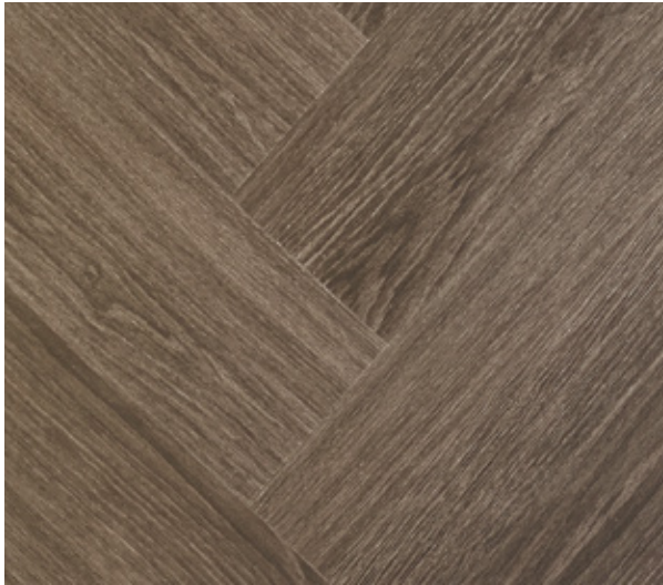
WE65H Soft Cloud