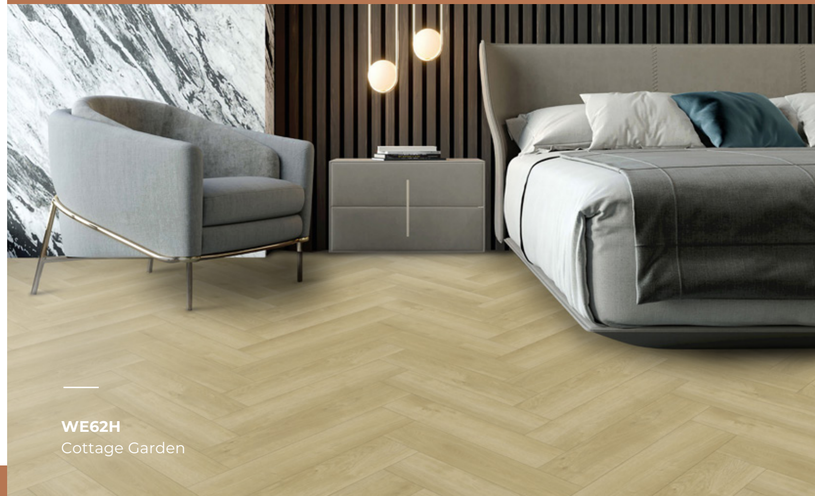
WE62H Cottage Garden