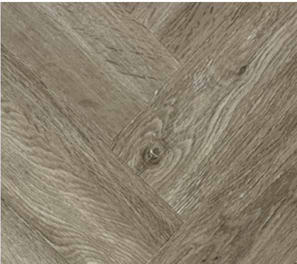
WE67H Scandi Grey