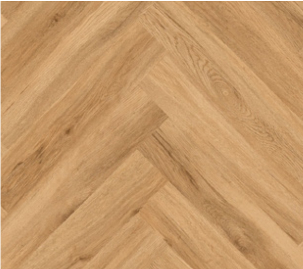
WE69H Caramel Wood