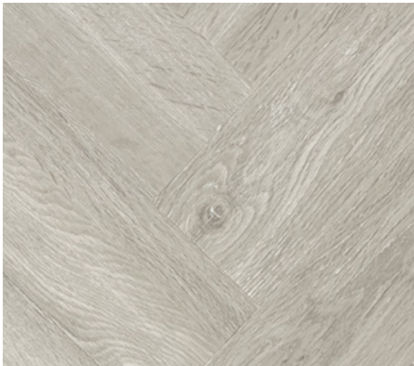
WE61H Nordic Cotton