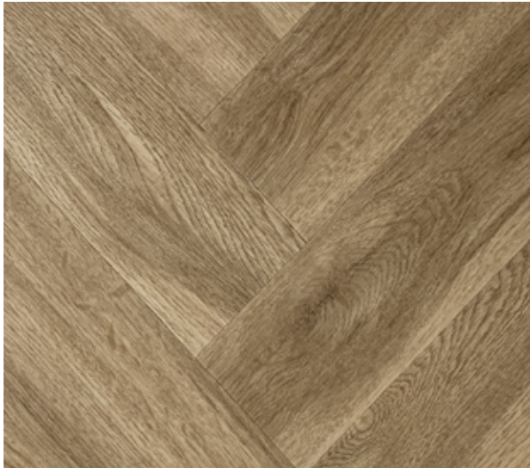
WE63H Golden Summer