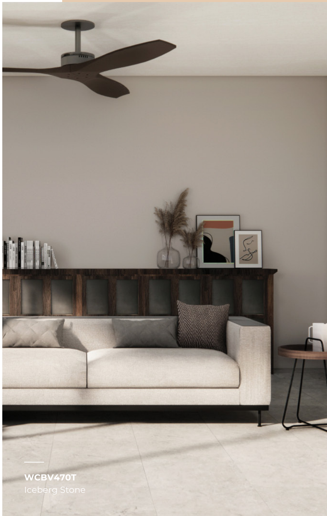
WCBV470T Iceberg Stone