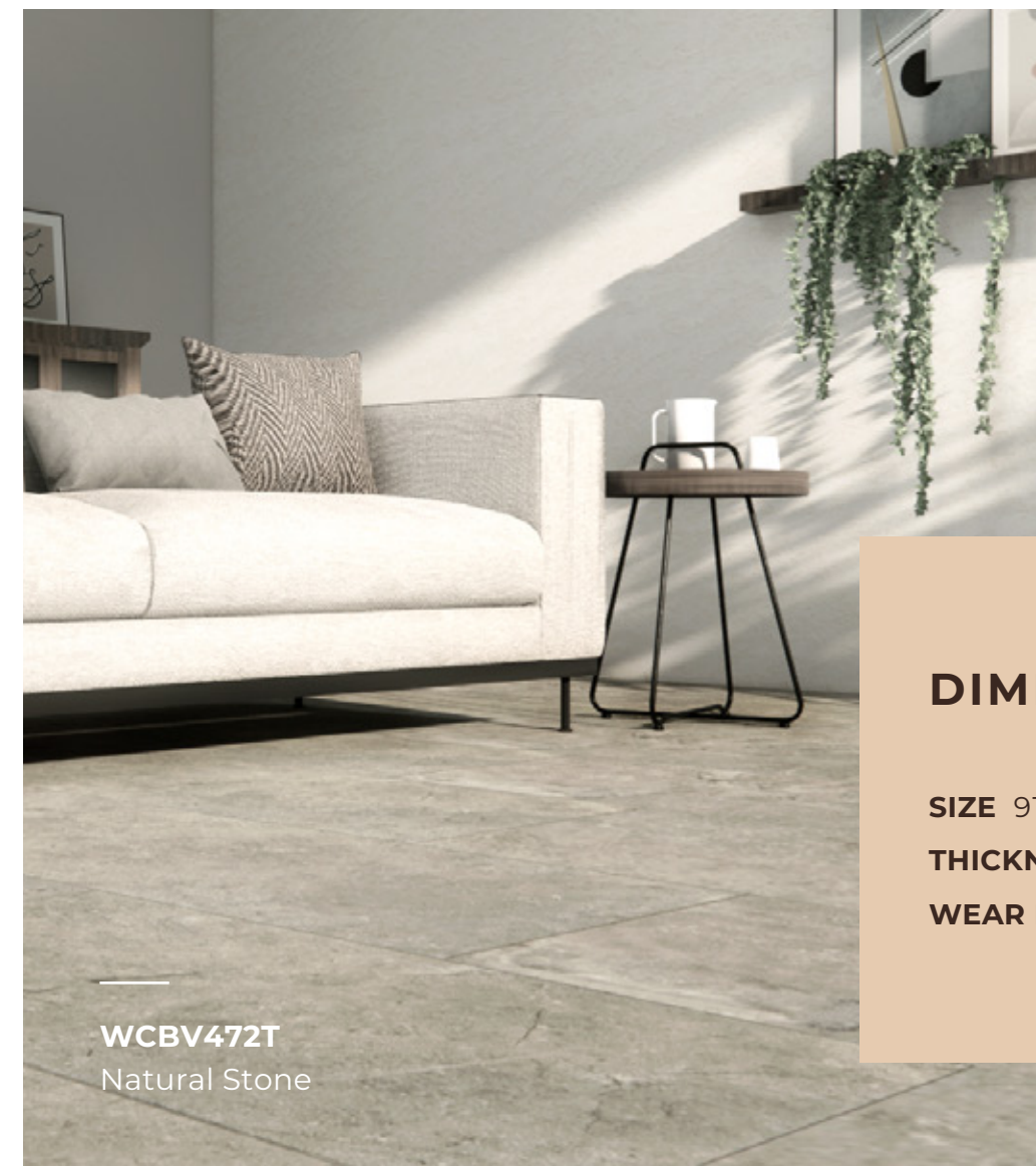
WCBV472T Natural Stone

With a larger format, the Grande vinyl tile collection is able to make smaller rooms feel larger while giving larger rooms an elegant look.