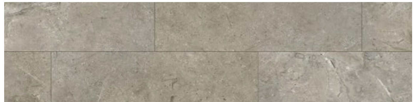
WCBV472T Natural Stone