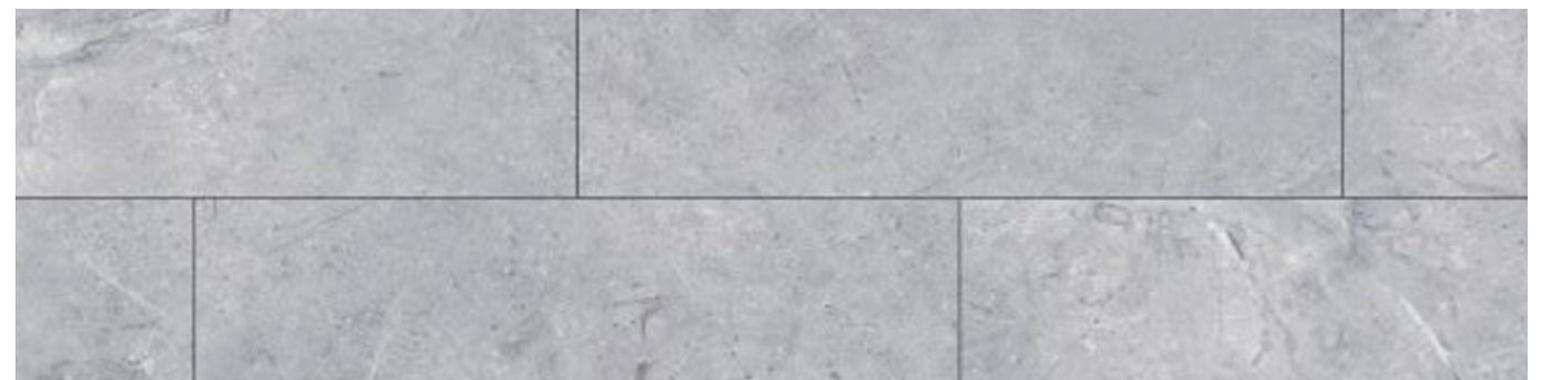
WCBV473T Titanium Rock